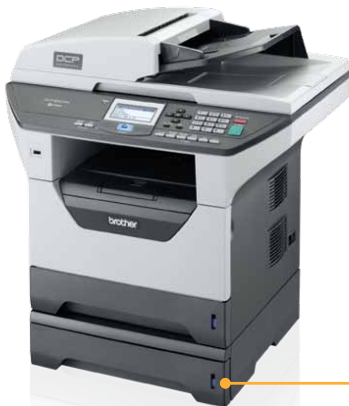
DCP-8085DN (WITH OPTIONAL LOWER TRAY LT-5300)