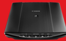
CanoScan LiDE 220