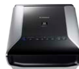
CanoScan 9000F Mk II CanoScan LiDE 220 CanoScan LiDE 120