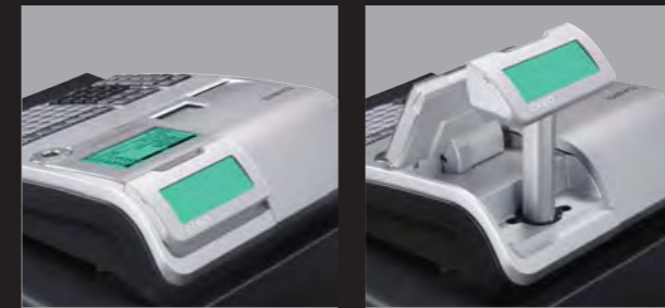
Large popup display

Character display and pop-up capability ensure easy readability for customers. Mistake-free register operation fosters customer trust and increases shop credibility.