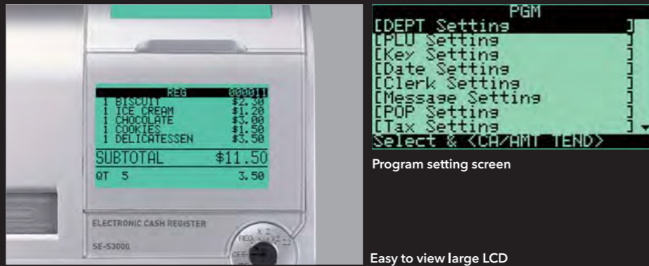
Program setting screen

The displays were designed to maximize viewability and ease of use. Ten-line display capability facilitates input and confirmation during checkout and register setup operations. And, the displays feature a tilt mechanism that permits angle adjustment and are backlit for accurate operation even in dark shop interiors.